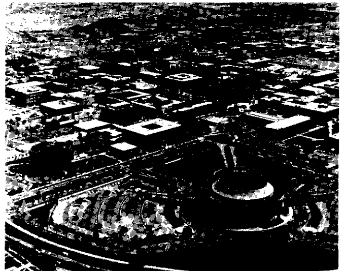
Arizona State University campus, Tempe, Arizona, USA

Pathology in invertebrate animals other than insects, for example marine invertebrates, will also be included in the meeting. Although emphasis on invertebrates is desired, any pertinent comparative information relating to vertebrates, including human, will be welcome. Proposed key areas are: spontaneous disease, experimental studies, pollution, aqua-culture, animal models of human disease, hematology, and biological